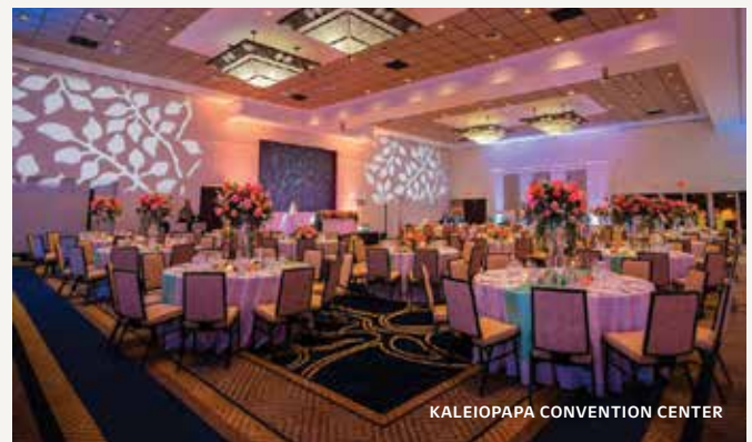
KALEIOPAPA CONVENTION CENTER