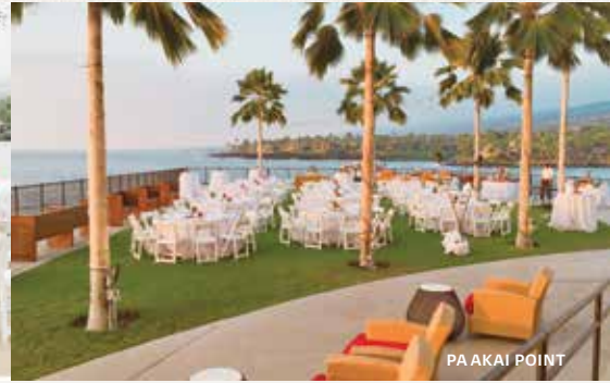
PA AKAI POINT

We allow up to two hours per ceremony and up to six hours per ceremony and/or reception event. Pricing varies on event location and preferred day of the week. In cases where the Food & Beverage revenue minimum is not achieved, the difference will be charged as a room rental fee. Ceremony and Reception site fees starting at $1,800.00. A food & beverage minimum is required for all receptions in addition to the site fee. Pricing for food & beverage minimums vary depending on venue and day of the week. Please inquire.